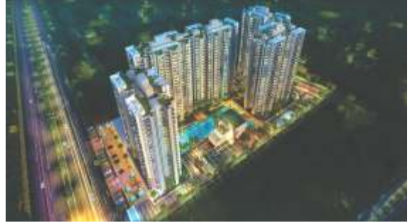
SHRI RADHA AQUA GARDENS