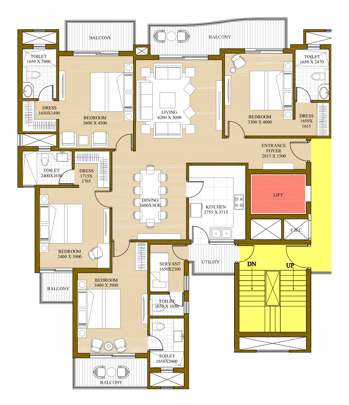
Super Area = 2400 Sq. Ft. <sup>#</sup>2001 Sq. Ft. (Built-up Area) + 399 Sq. Ft. (Common Circulation + Services) Carpet Area - 1568 Sq. Ft.