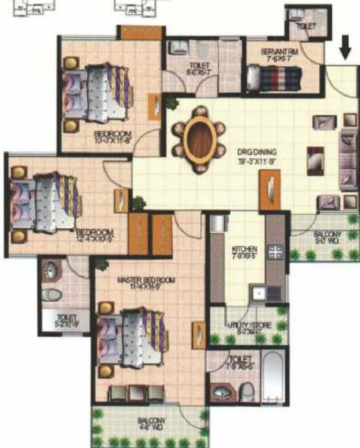
3 Bed + Servant + 3 Toilet