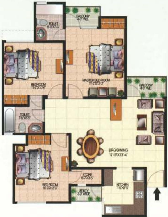
3 BED + STORE + 2 TOILET