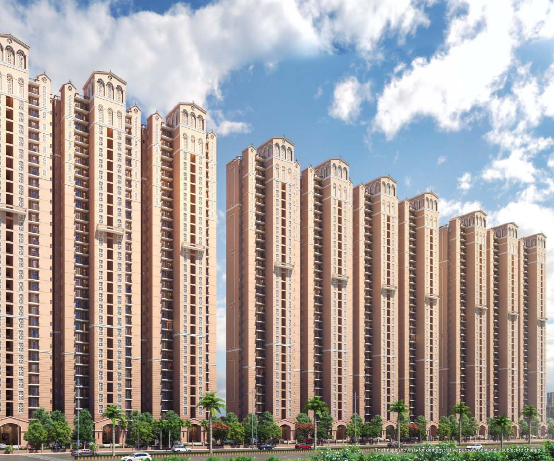
The image shown is for demonstrative purpose only and is subject to change.