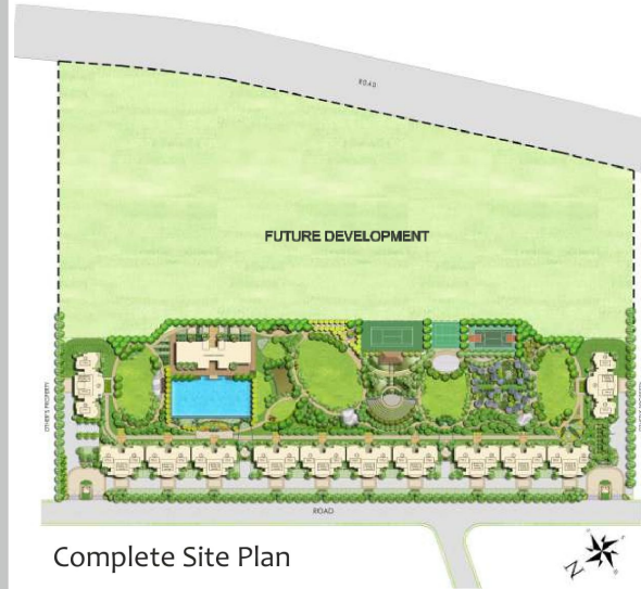
Complete Site Plan

Disclaimer: The Site Plan shown is tentative. The overall layout may vary because of statutory/design reasons.