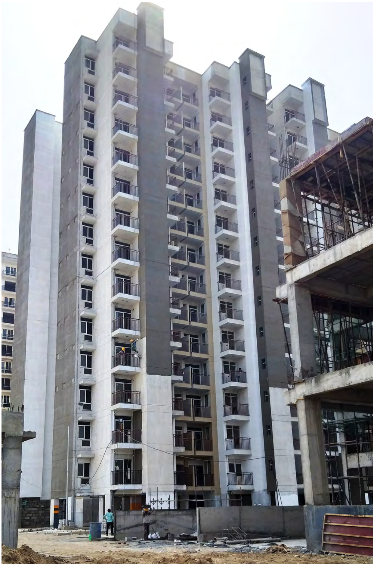
TOWER - H