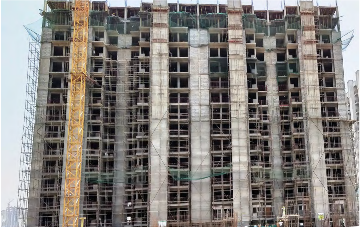
TOWER - F