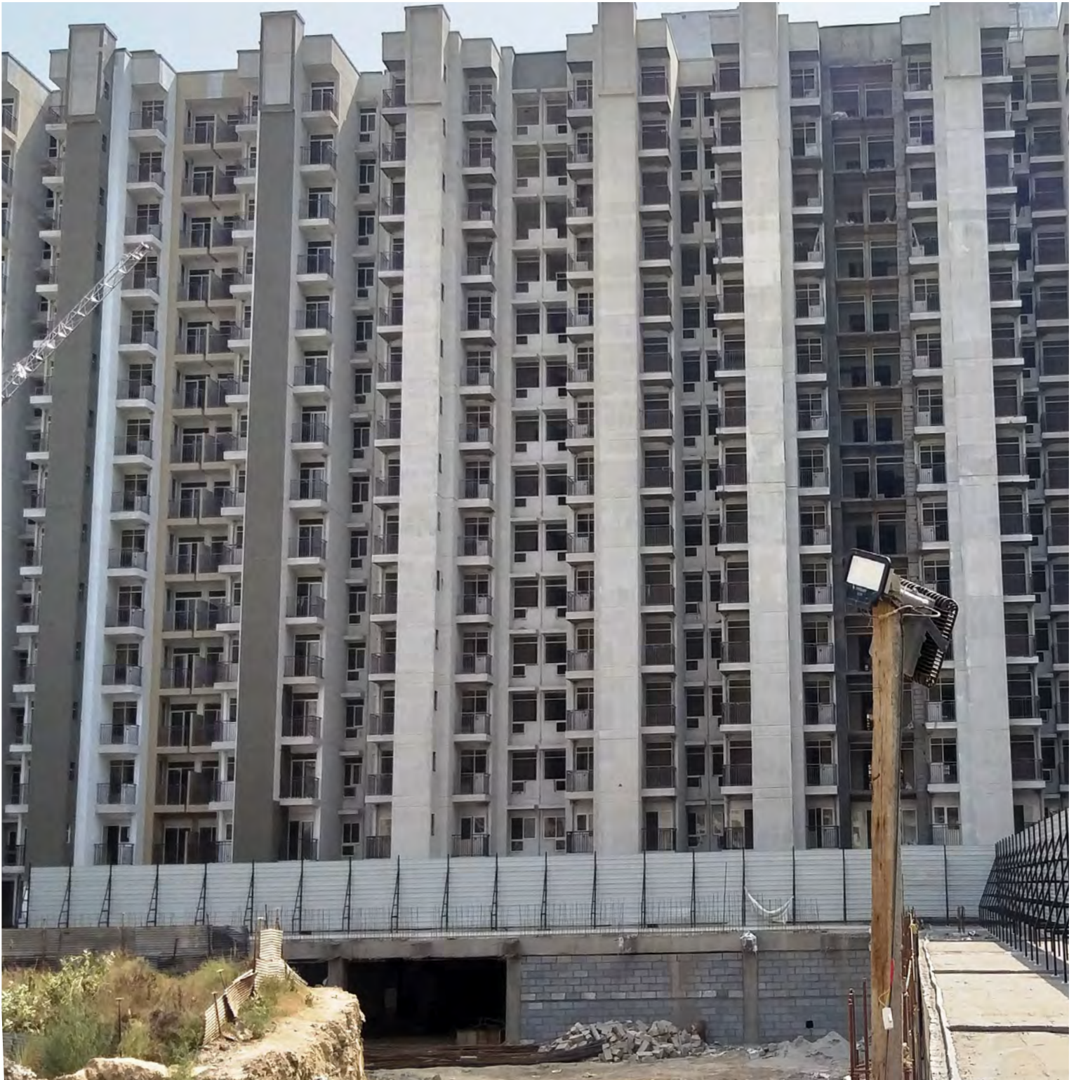
COMBINED VIEW OF TOWER - H & J