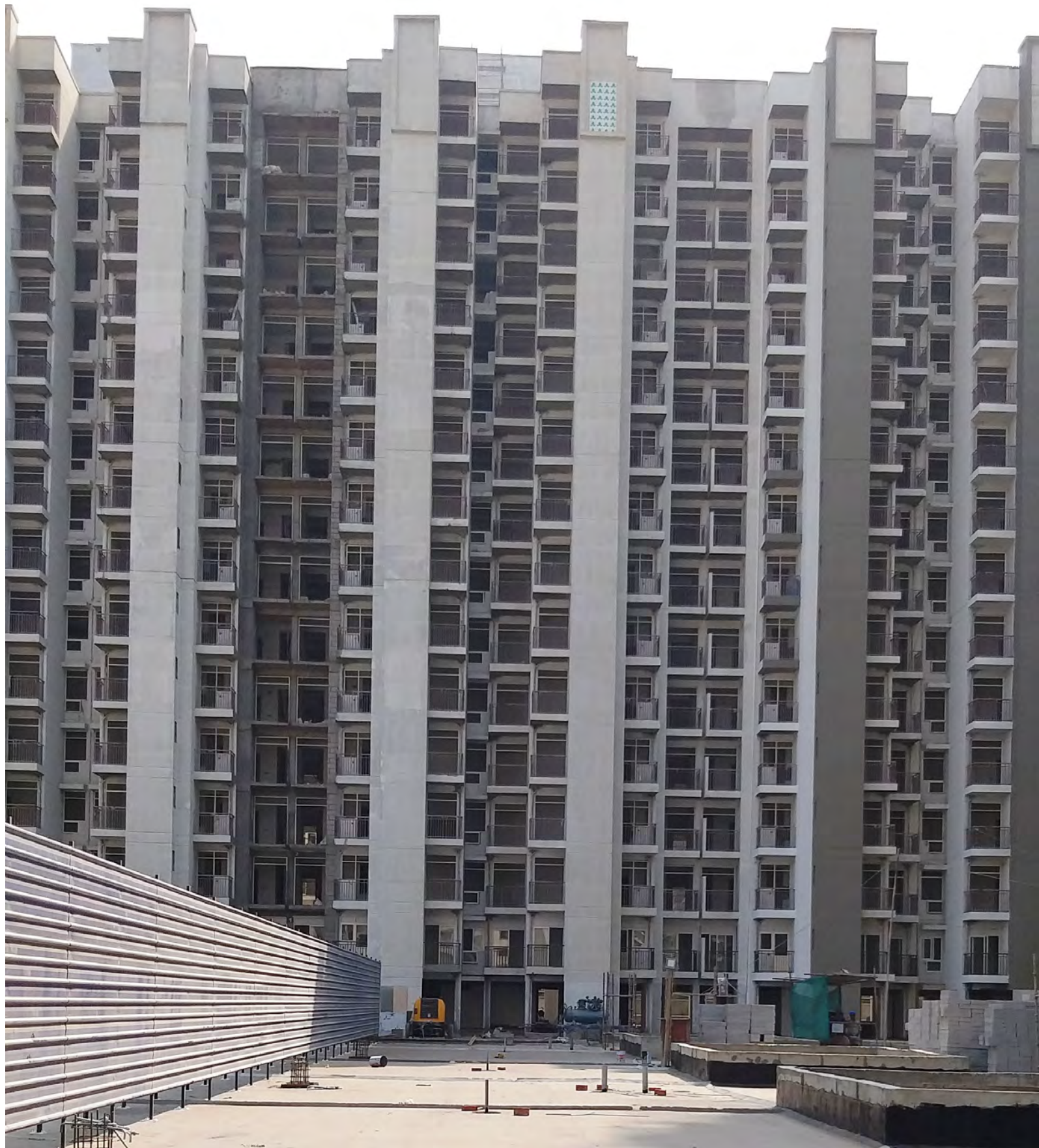
TOWER - J