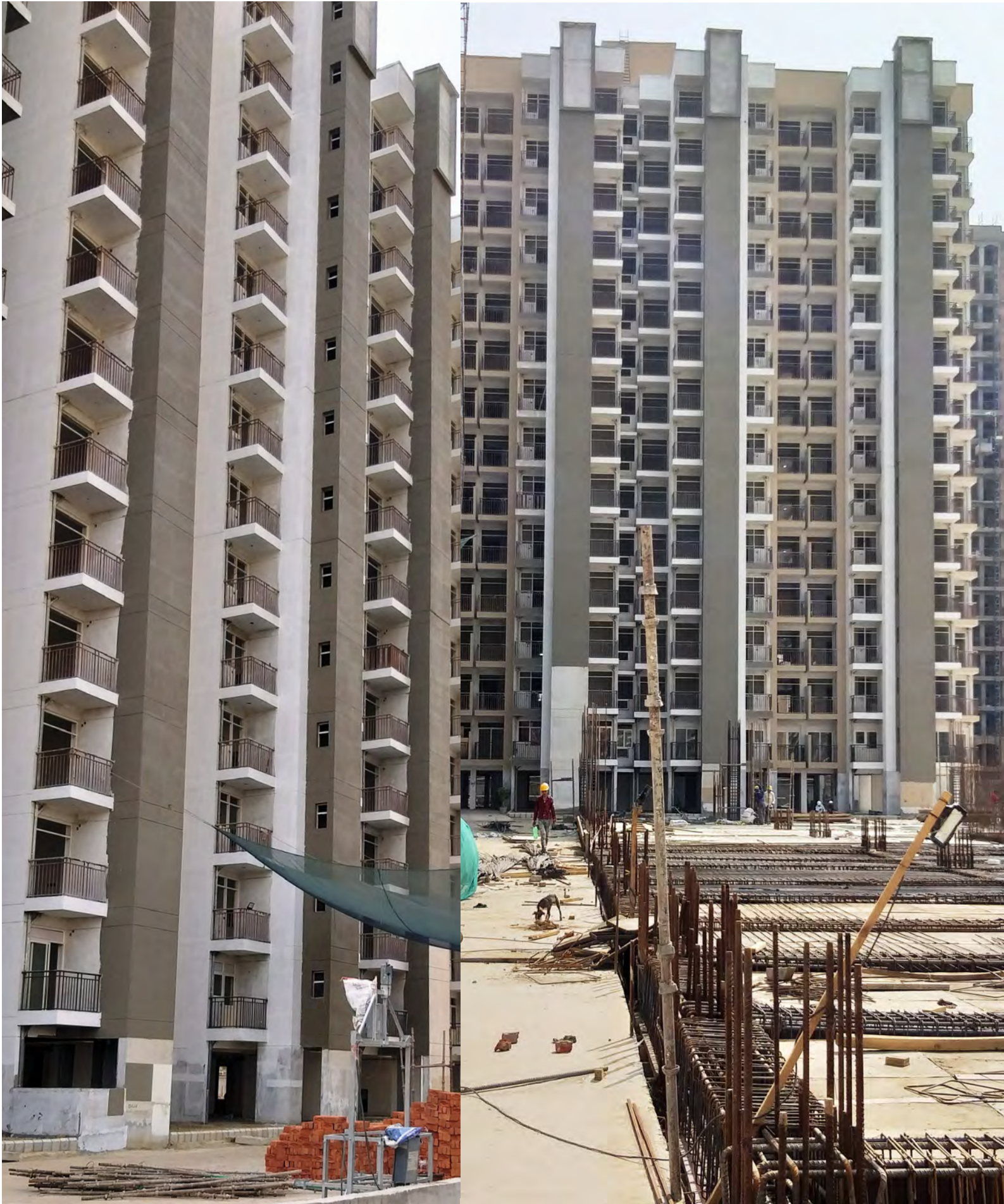
TOWER - K