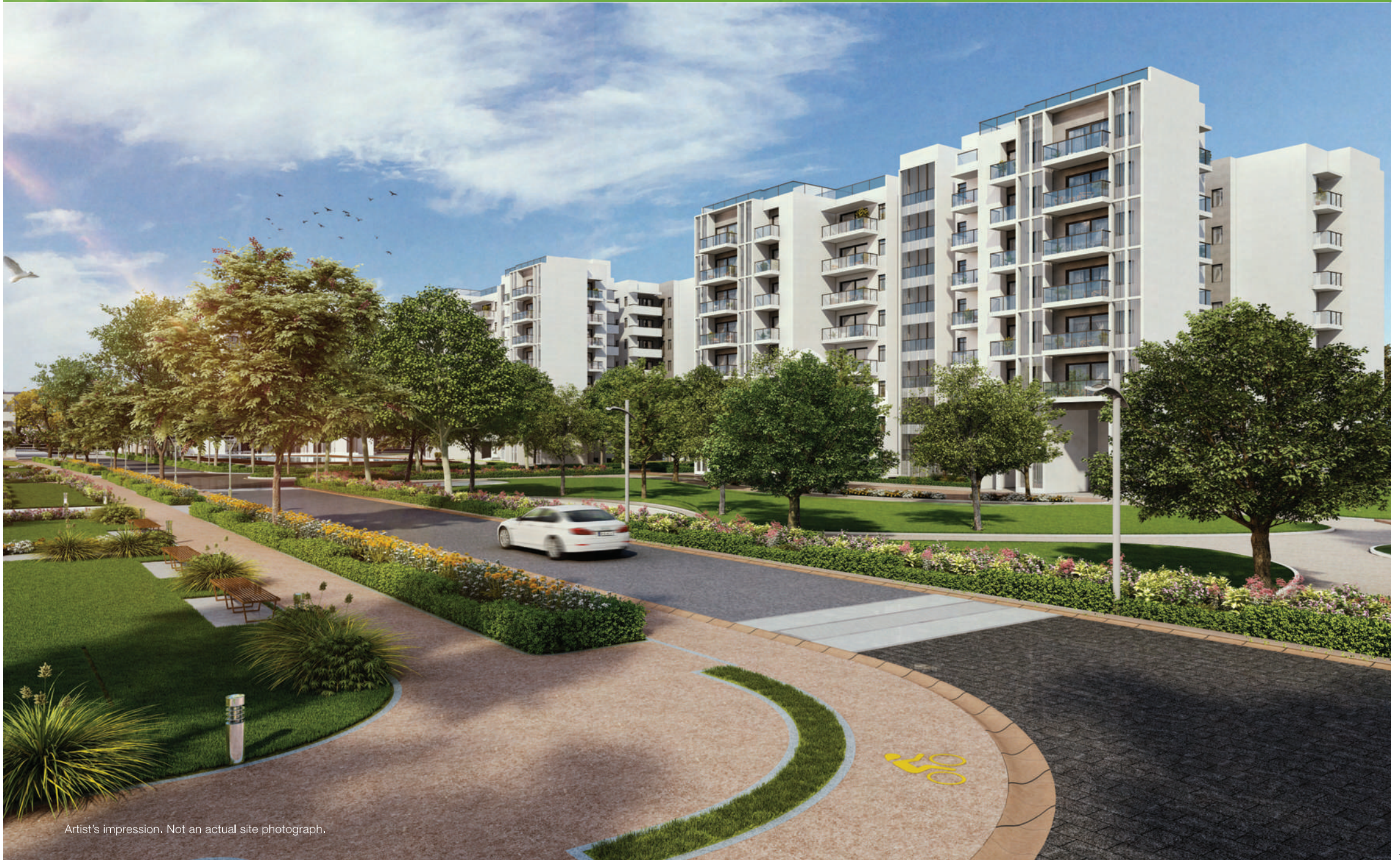
Artist's impression. Not an actual site photograph.