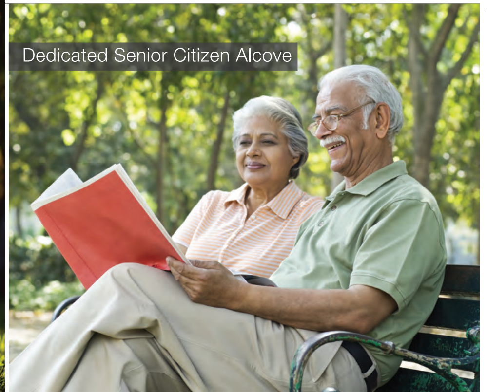
Dedicated Senior Citizen Alcove