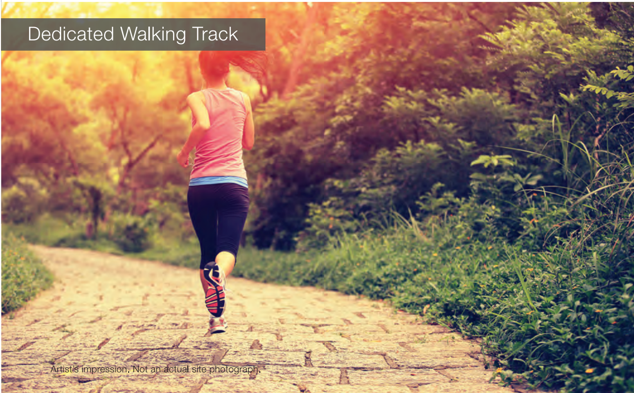
Dedicated Walking Track

Artist's impression. Not an actual site photograph.