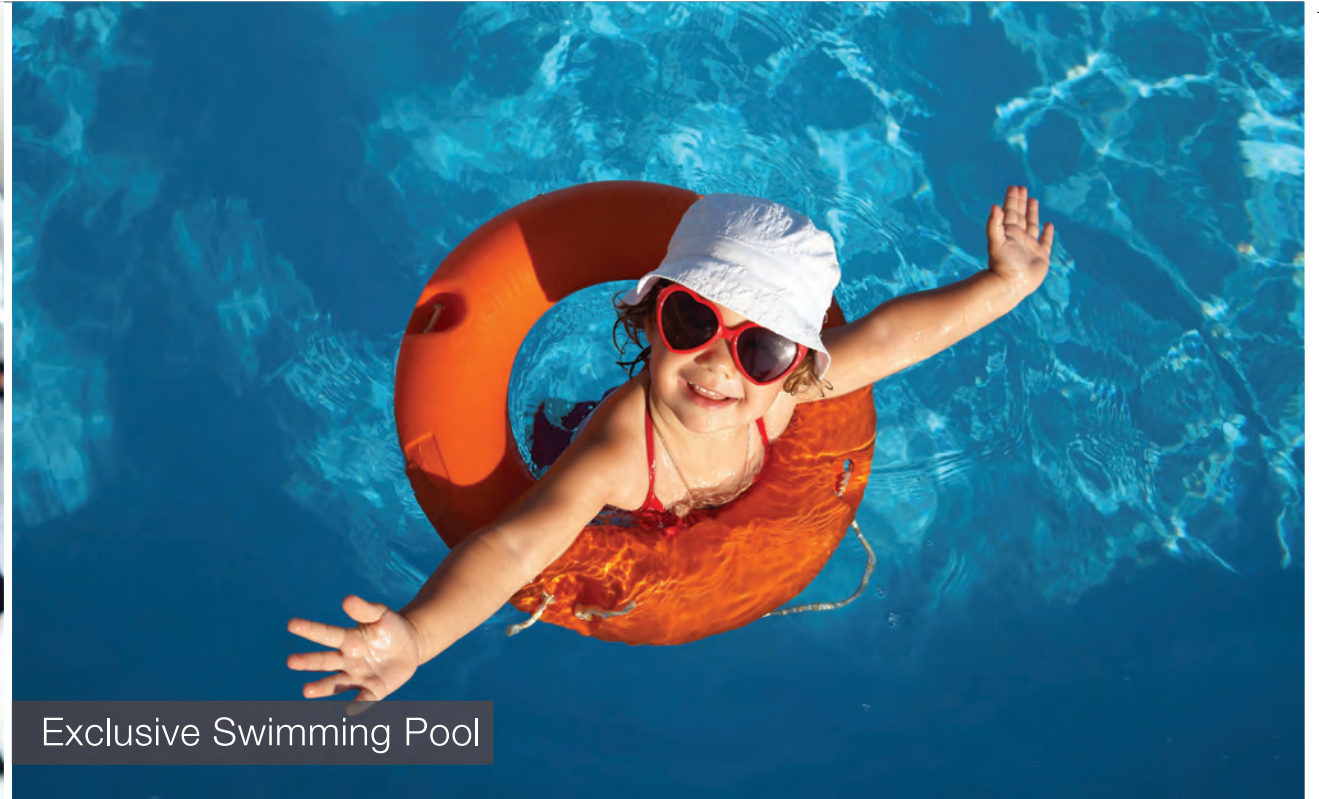
Exclusive Swimming Pool