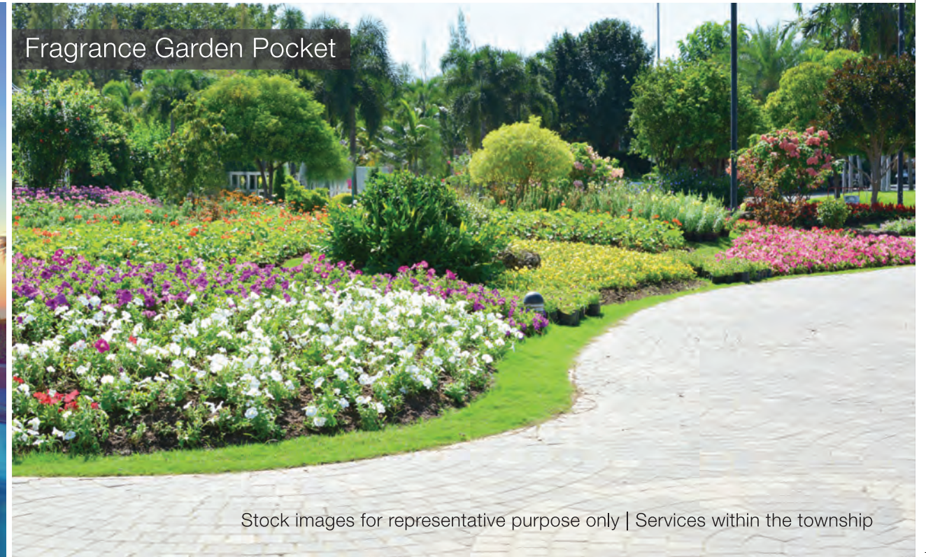
Fragrance Garden Pocket

Stock images for representative purpose only | Services within the township