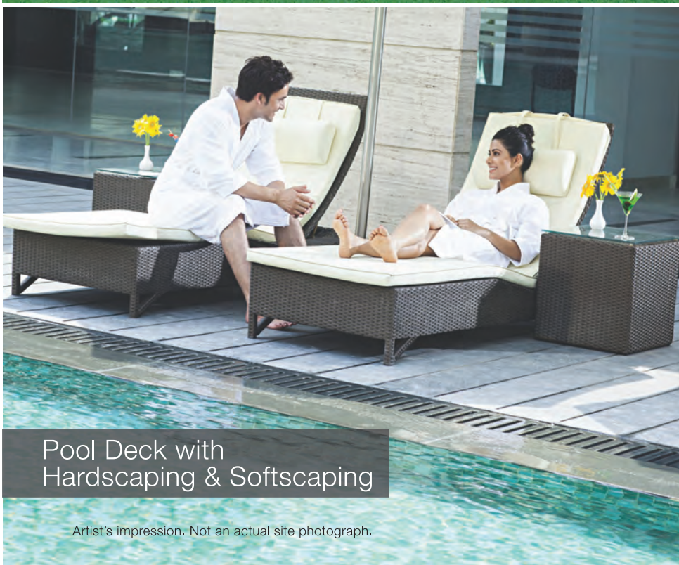
Pool Deck with Hardscaping & Softscaping

Artist's impression. Not an actual site photograph.