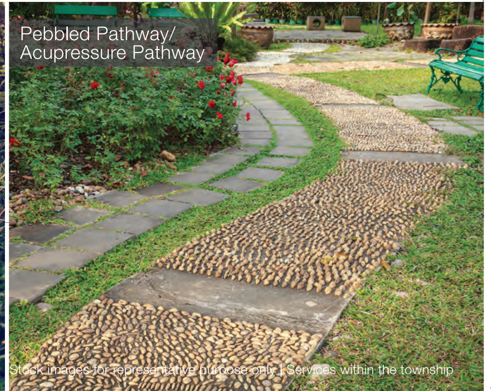
Pebbled Pathway/ Acupressure Pathway

Artist's impression. Not an actual site photograph.