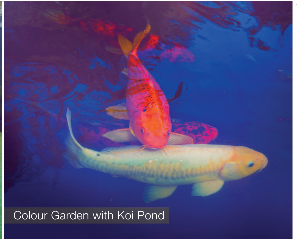
Colour Garden with Koi Pond