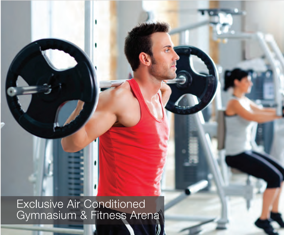
Exclusive Air Conditioned Gymnasium & Fitness Arena