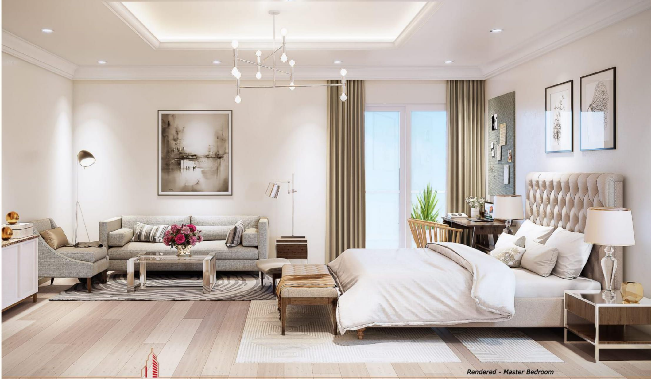
Rendered - Master Bedroom