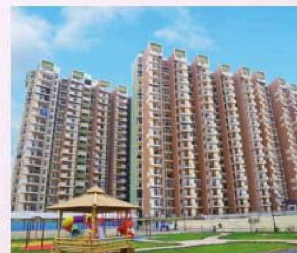
SG GRAND Rajnagar Extn., Ghaziabad