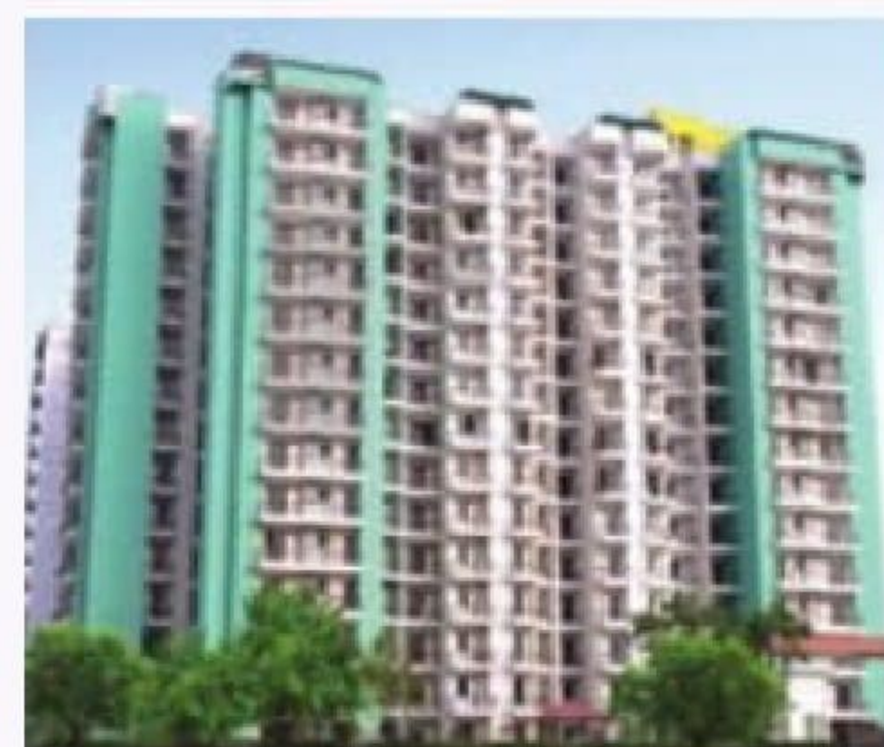
SG HOMES Sec-3, Vasundhara, Ghaziabad