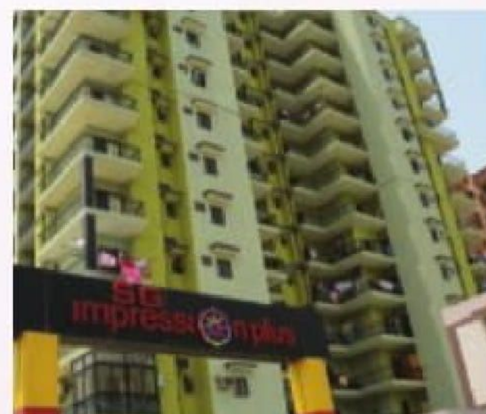
SG IMPRESSIONS PLUS Rajnagar Extn., Ghaziabad