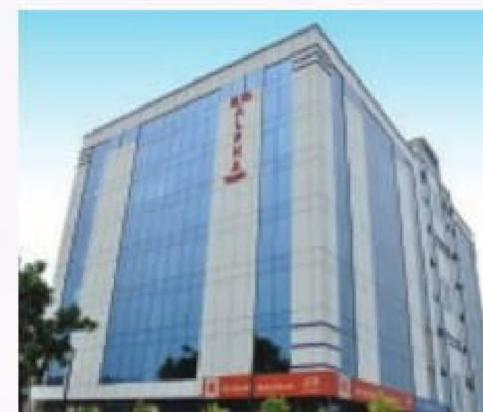
SG ALPHA TOWER Sec-9, Vasundhara, Ghaziabad Commercial