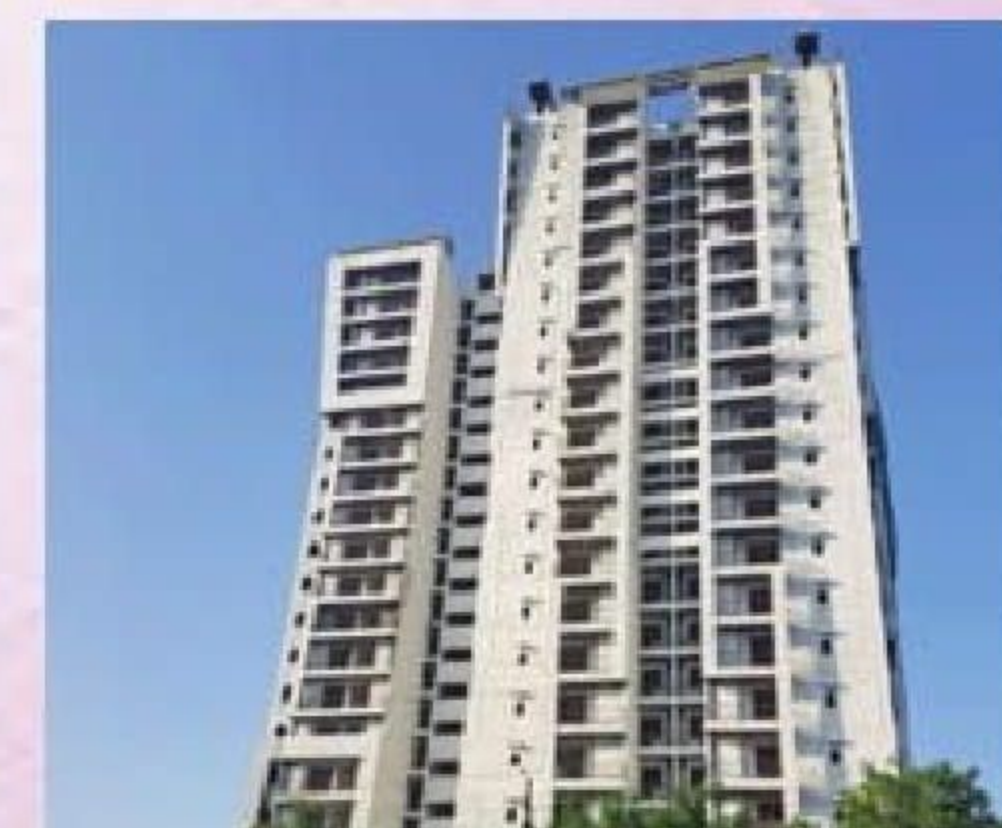
SG OASIS Sector-2B, Vasundhara, Ghaziabad