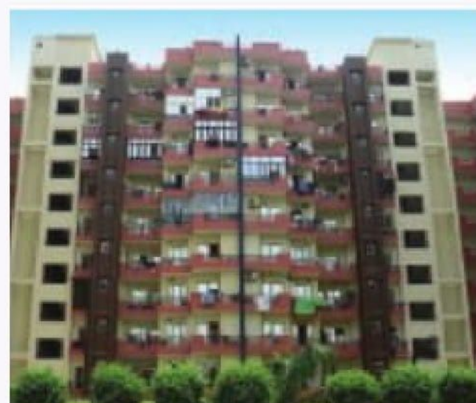
SG IMPRESSIONS Sec-4B, Vasundhara, Ghaziabad