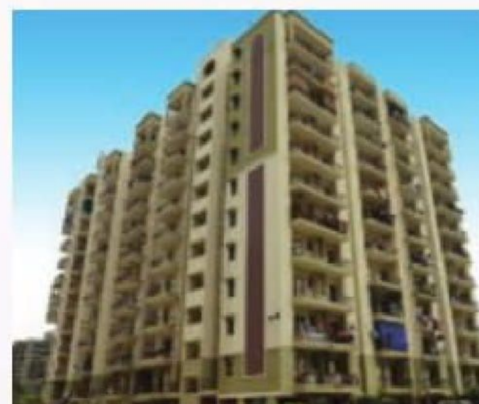
SG IMPRESSIONS 58 Rajnagar Extn., Ghaziabad