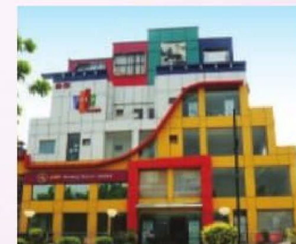
SG BETA TOWER Sec-3, Vasundhara, Ghaziabad Commercial