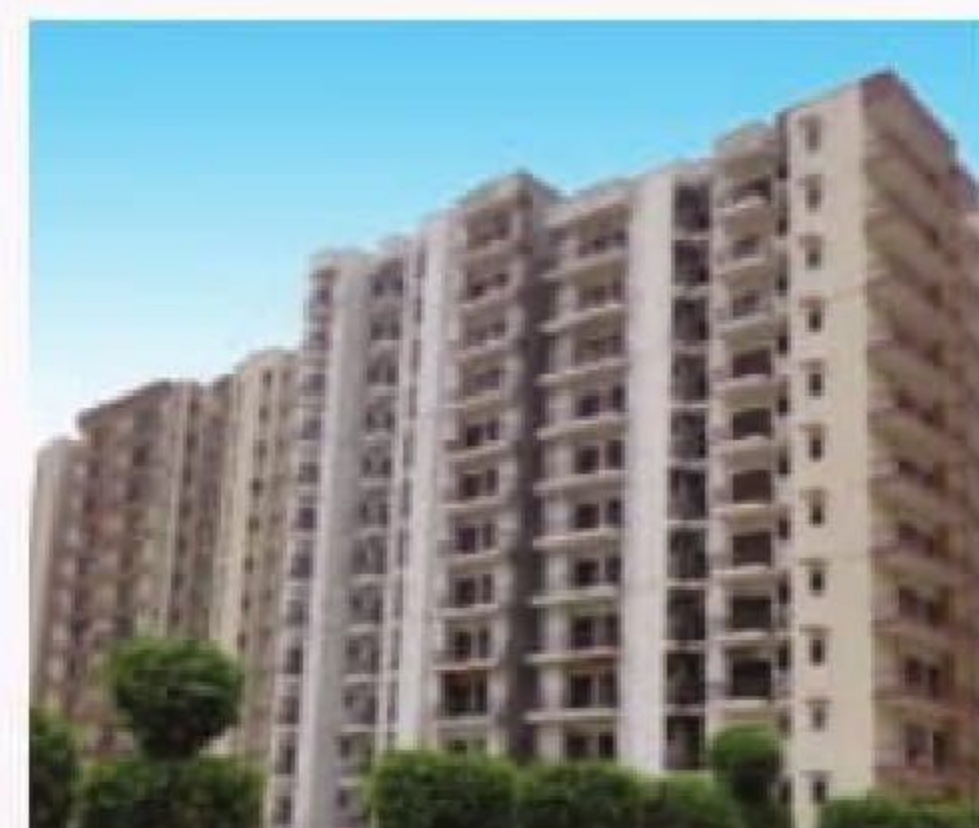
SG IMPRESSIONS 58 Phase-2, Rajnagar Extn., Ghaziabad