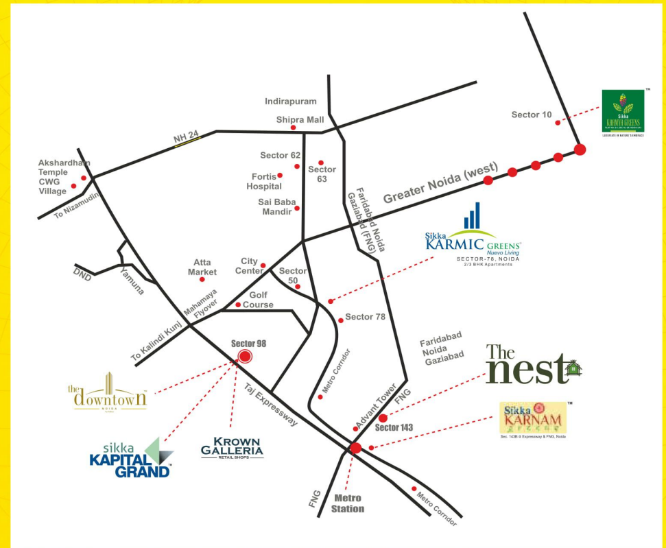
Map for Illustration Purpose Only, Not to Scale